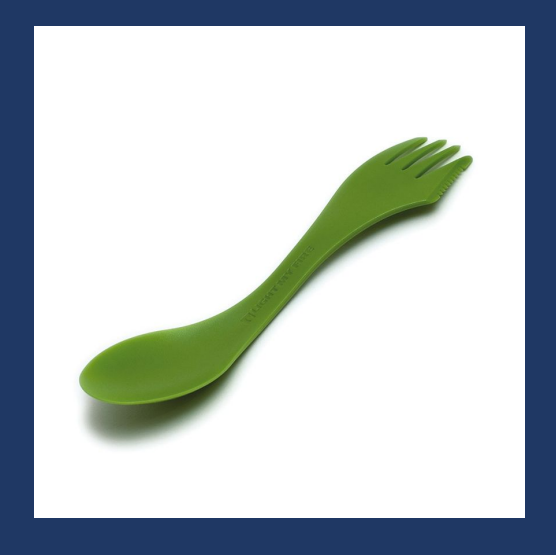
Spork Spoon & form